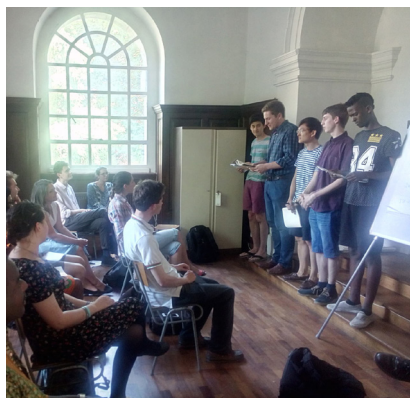
CTC Summer Interns 2015