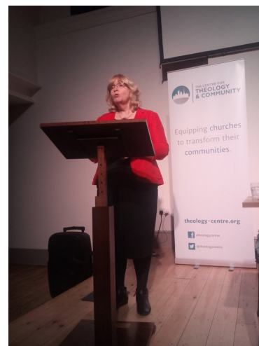
Baroness Sherlock delivering Buxton Lecture